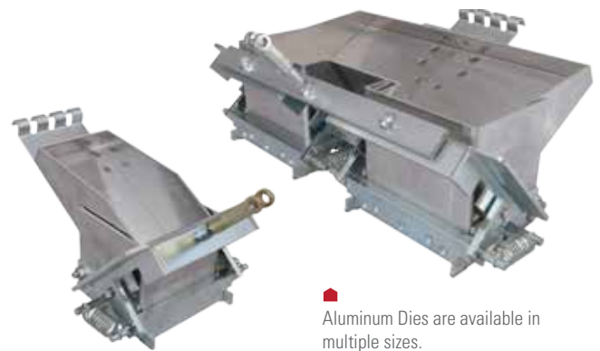
▶ Aluminum Dies are available in multiple sizes.